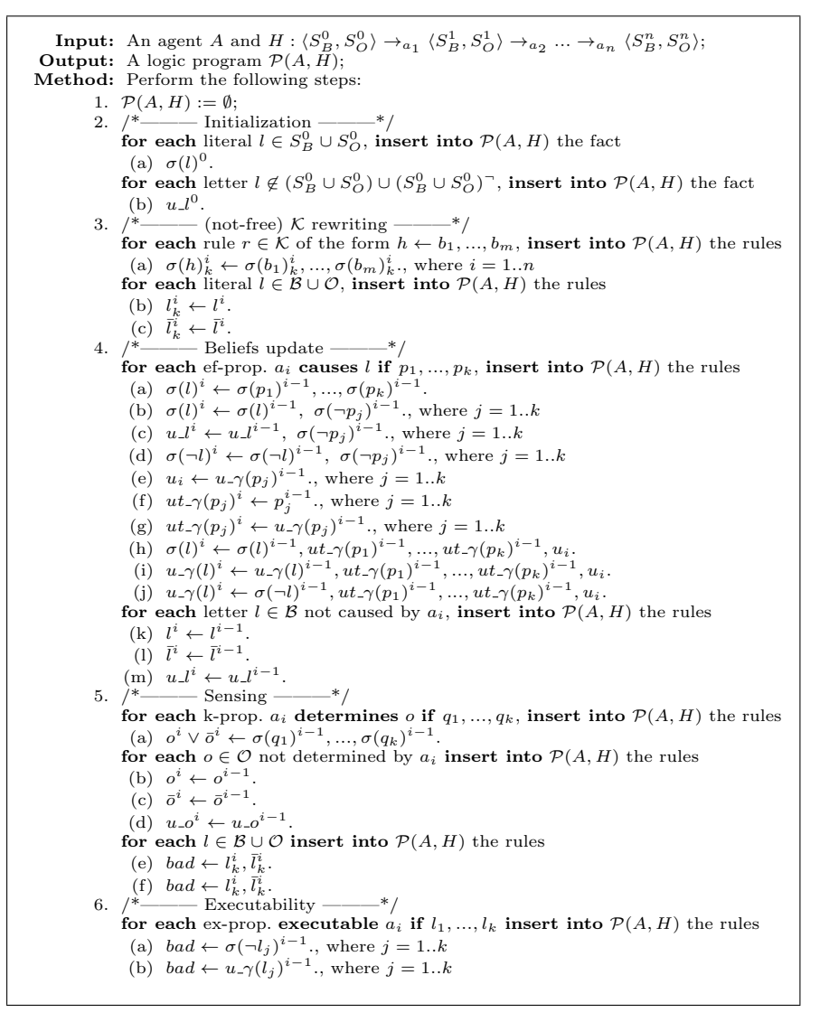
Fig. 6 Algorithm RepairToANSW.

predicate symbol \bar{p} ; and, for notational convenience, we make use of the function \sigma such that \sigma(p) = p and \sigma(\neg p) = \bar{p} . In addition, for each literal l, by \gamma(l) we shall denote the letter on top of which it is built. Also, since we are dealing with 3-valued interpretations, we shall use the symbol u_p to denote that the truth value of p is currently unknown.